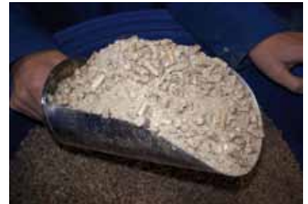
Figure 2: Wood pellets - 6 mm (left), Figure 3: Wood chips - 0-100 mm (top right), Figure 4: Torrefied pellets - 6 mm (bottom right).